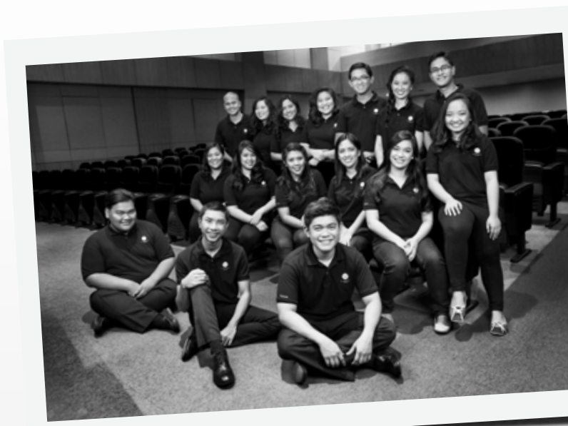
The De La Salle University Chorale