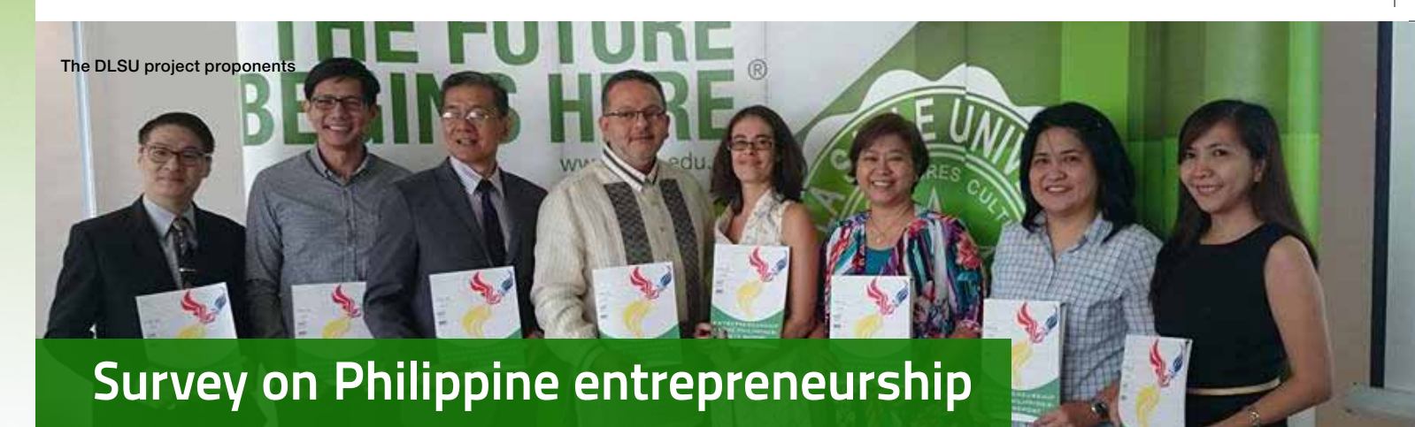
The DLSU project proponents