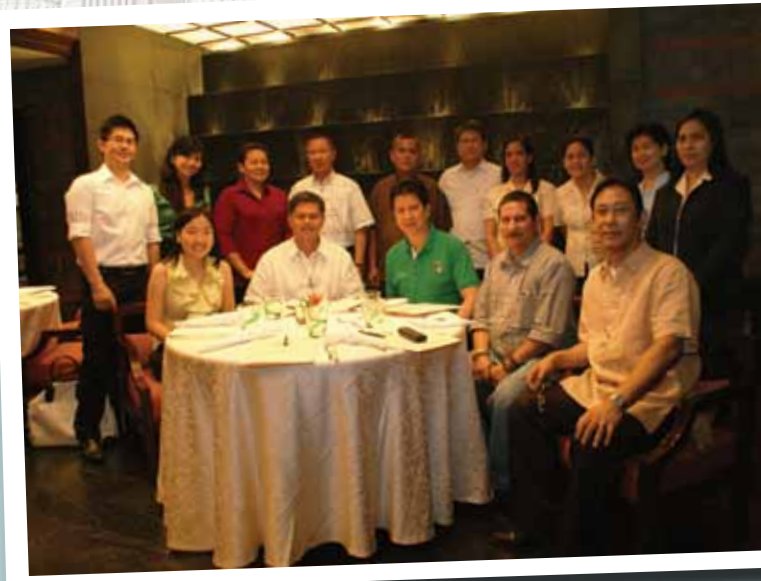
The MSCB members at Sofitel Philippine Plaza.

The consensus was agreed upon after a meeting with the various sectoral representatives of the community. The formal signing of the Memorandum of Agreement was held last January 13.